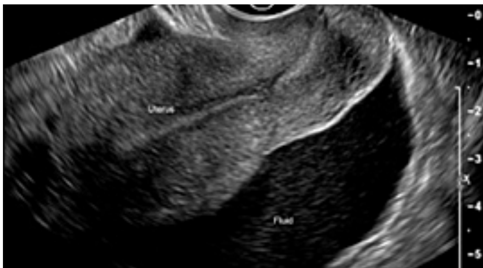
Figure 2. Uterus with free fluid in cul-de-sac (longitudinal view)